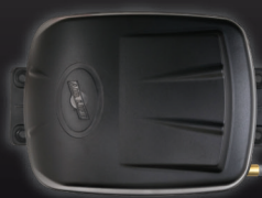
On-board air compressor